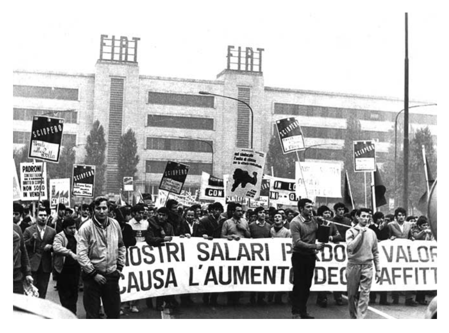
Figure 2. Car workers striking in front of FIAT's Mirafiori plant during the "Hot Autumn", a period of escalating workers' unrest. The photo conveys the boastful enthusiasm of the participants, very often young workers and southern immigrants.

and measured its impact in terms of the actual transformation of the relations of production, rather than the theoretical value of their statements. Raya Dunayevskaya recapitulated this attitude when she wrote that "there is a movement from practice to theory that is literally begging for a movement from theory to practice to meet it".<sup>43</sup> The intended audience for newsletters and pamphlets – their main tangible output – was composed of workers and activists in the labour movement, rather than of members of an intellectual milieu. The distinction between intellectual practices and political practices is slippery (as the former may have a political content and the latter a theoretical significance),<sup>44</sup> but it is nevertheless important to draw, in light of the fact that a great part of the historical evidence pertaining to those groups casts them, retrospectively, more in the role of intellectuals than of political activists.