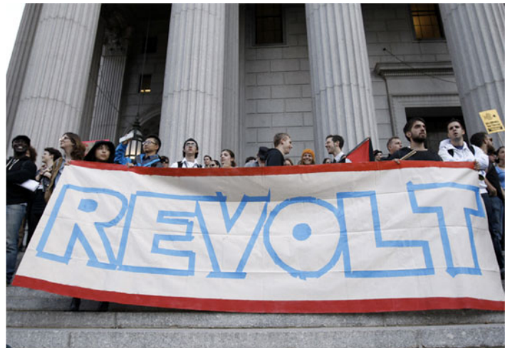
Occupy Wall Street, New York, October 2011.

Even before “the multitude” became a common touch-stone for dreams of revolution, there was, famously, Seattle 1999, when anti-corporate protests brought environmentalists and community activists together with organized labor to block a meeting of the World Trade Organization, a scenario repeated at multiple locations in several countries in the years since. 2 It is not news that the processes that go under the name of globalization, which center on the flows of capital, goods, and labor, create a unity that does not always serve the interests of capital or the capitalists.