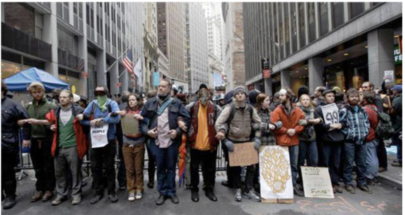
New York Stock Exchange blockade, New York, November 2, 2011.