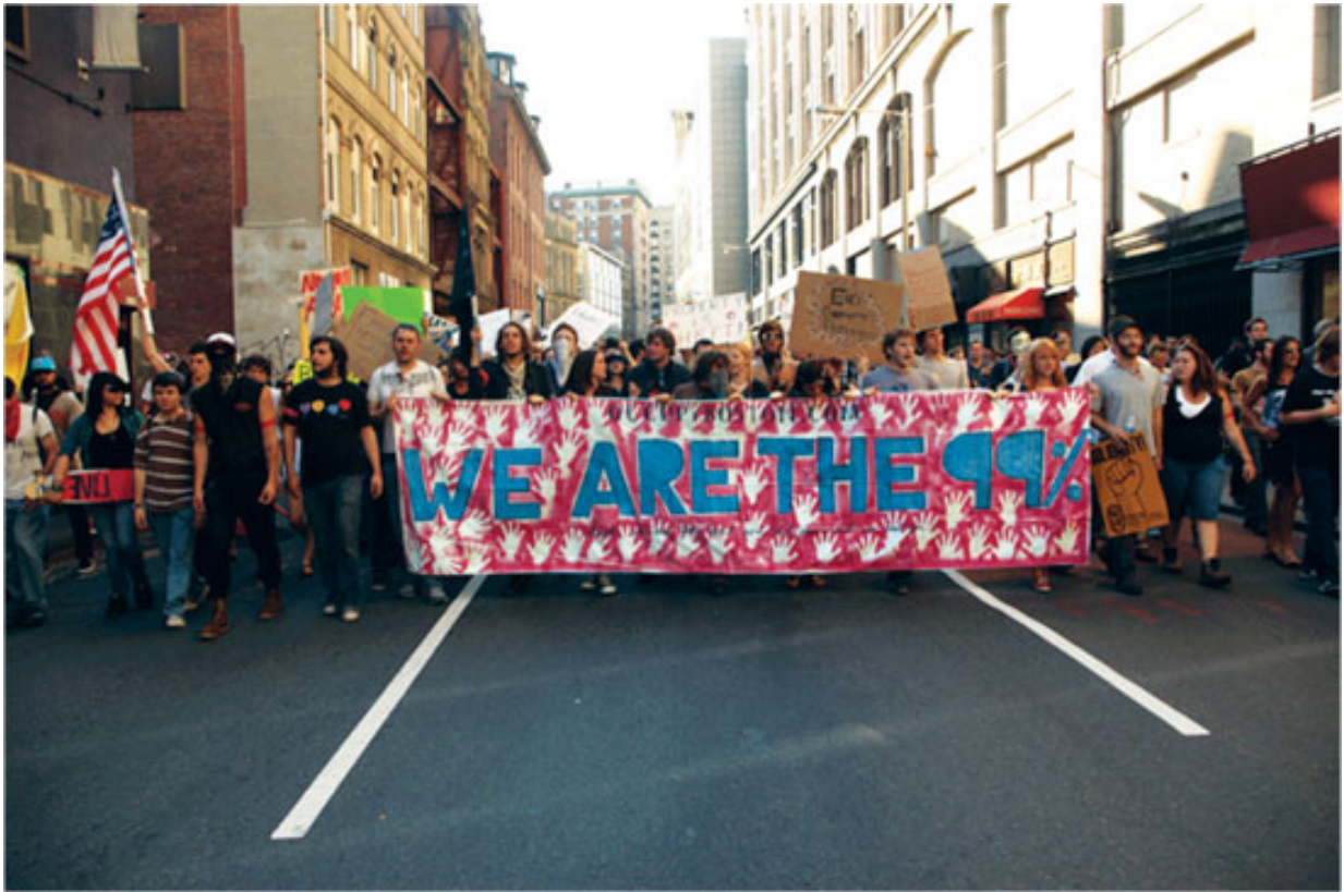
Occupy Boston protest.