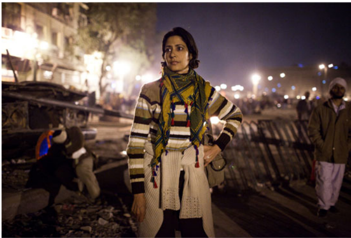
February 2011. A former television journalist occupied a checkpoint on Tahrir Square, where she checked women who wished to enter the Square.

But precarization is not a necessary consequence of any particular form of labor.