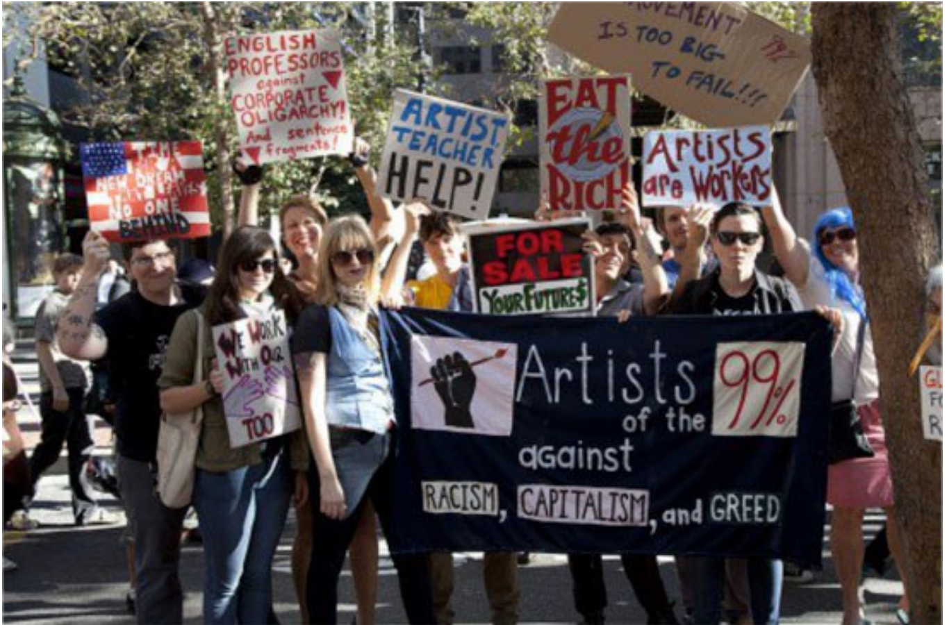
Artists at the General Strike, Oakland, November, 2011.