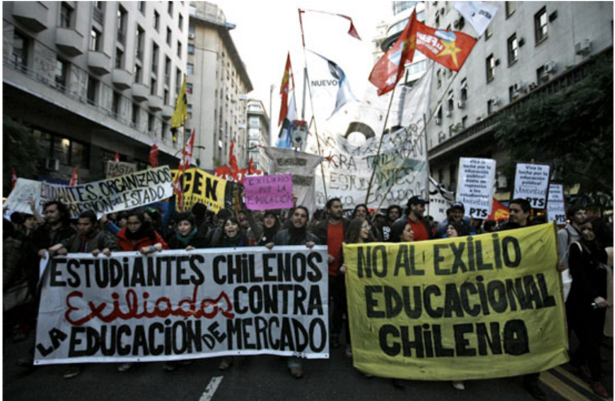
Argentine and Chilean students march to the Chilean Consulate in Buenos Aires, on August 5, 2011, repudiating the police repression against Chilean students during demonstrations in Santiago de Chile.