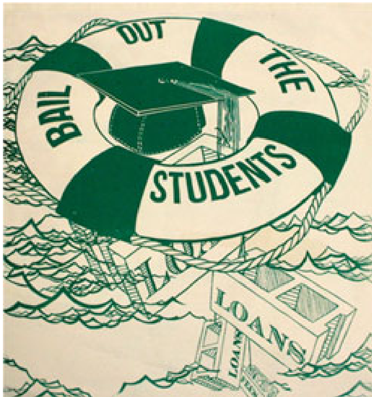
Poster created by Chelsea Peil, Roger Peet, Katherine Ball, Portland, Oregon.

The ongoing round-the-world occupations, which have drawn inspiration from the uprisings across the Arab world in 2011, are driven by the frustration of the young educated middle classes – in the Arab case fairly new ones – confronting societies controlled by huge-ly rich ruling elites but having little hope of a secure future for themselves, despite their university educations. These are societies that had made no effort to create modern welfare or even neoliberal states, nor to control corruption, bureaucratic indifference, and flagrant nepotism, nor to institute more than the appearance of democratic governance. Protesters in the