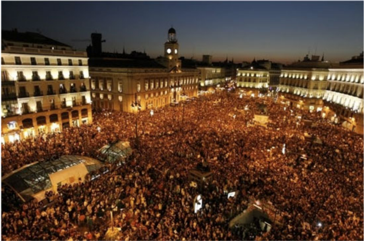
Encampados (Indignados) Camp, Puerta del Sol, Madrid.