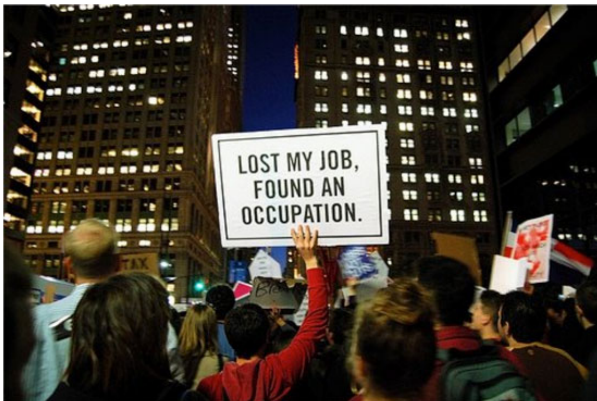
Occupy Wall Street at Foley Square, October 5th, 2011.