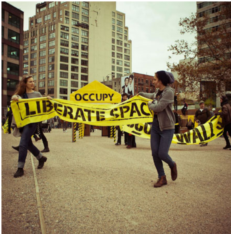
Occupy Wall Street, New York.