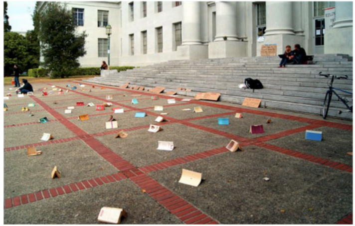
Book-tents at Sproul Hall, at UC, Berkeley, after mandatory clearing of encampment, November 2011.

Such protests – as in France in 2006, which saw widespread mobilization against “precarization” (alternatively, precaritization), as well as the subsequent uprisings in the Paris ban-lieues or in England in August 2011 – also reflect the anger of working-class youths, especially their rage against racist police violence. In the English case, these young people were out there smashing and looting together with young members of the middle class. Some of the latter group had mobilized months earlier – as young Chileans are doing still – thanks in no small part to crushing increases in school fees driven by the Tory/Liberal Democrat governing coalition. The protests of these groups, these classes, have been fired by the recognition that there are likely no secure jobs for them, or perhaps any employment at all.