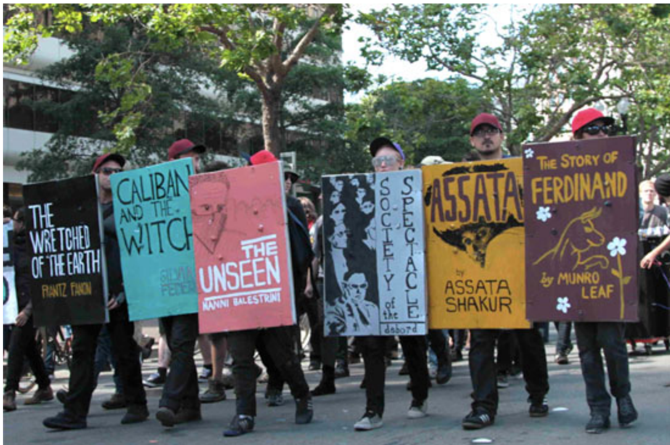
Book Bloc, Occupy Oakland.